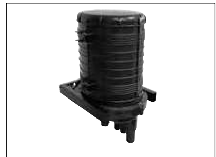
Wall Mounting Bracket holding an FDN Closure

The FDNA3763 is manufactured from powder coated stainless steel and is suitable for use with the FDN A length closure only. The wall mounting bracket offers an effective method of mounting the closure and is quick and easy to install.