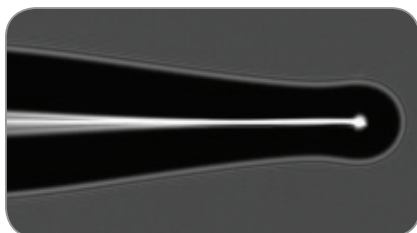
Tapered Probe with Small Ball End